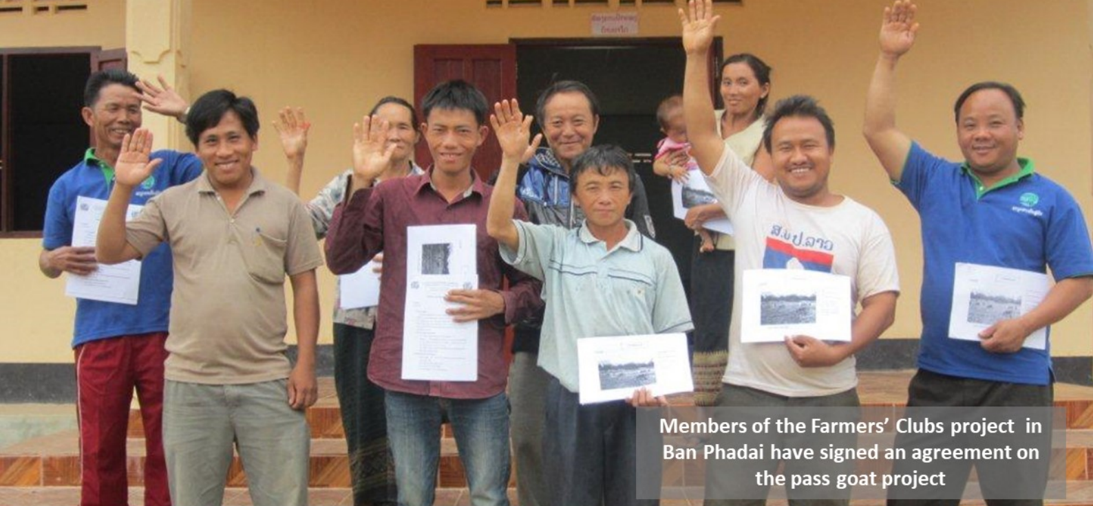
Members of the Farmers' Clubs project in Ban Phadai have signed an agreement on the pass goat project