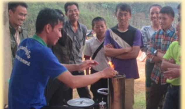
The project leader in Phameuang demonstrates how to cook on a Gasifier