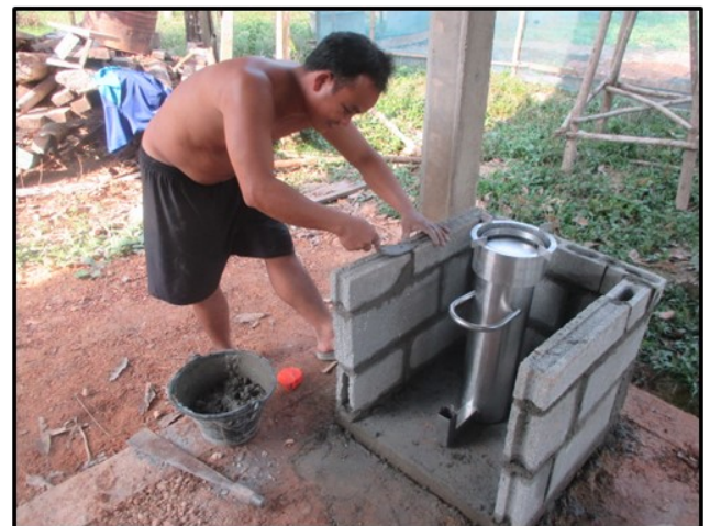
All the families have built an enclosure around their Gasifier for protection, as it gets very hot when in use