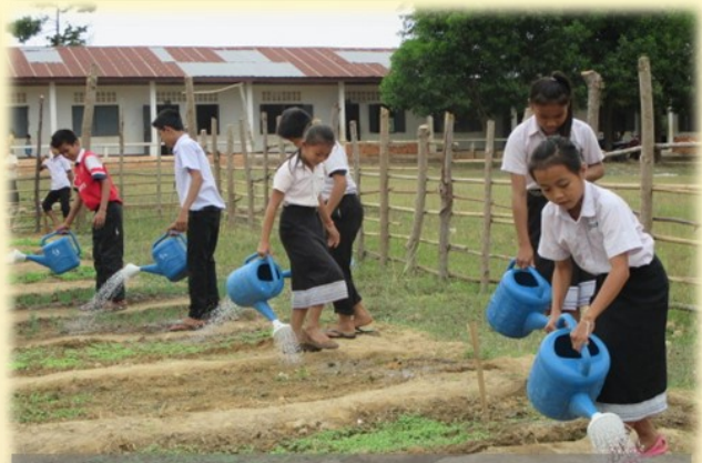
Students from Nakam Primary school maintain their school garden every day