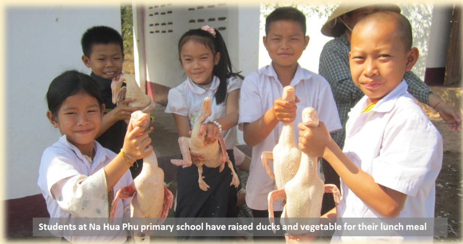
Students at Na Hua Phu primary school have raised ducks and vegetable for their lunch meal