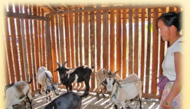
A project member proudly shows her newly built goat house