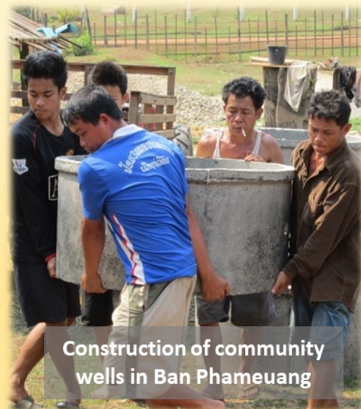
Construction of community wells in Ban Phameuang