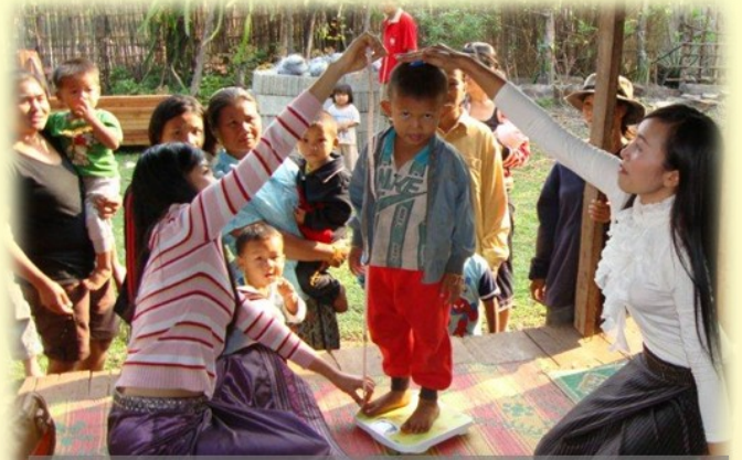
All children under 5 in the Child Aid projects get 2 health check ups per year