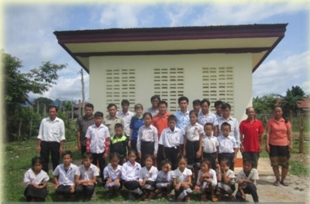
One of the new school toilets built by HPP and funded by Australian Embassy