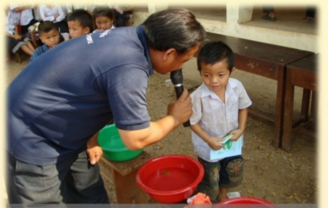
The children in Phameuang learn about the importance of hand washing