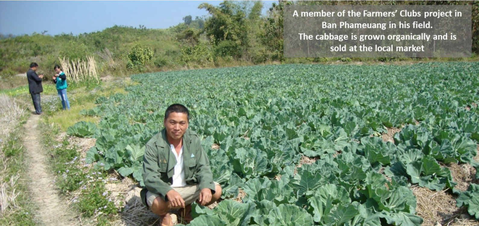
A member of the Farmers' Clubs project in Ban Phameuang in his field. The cabbage is grown organically and is sold at the local market