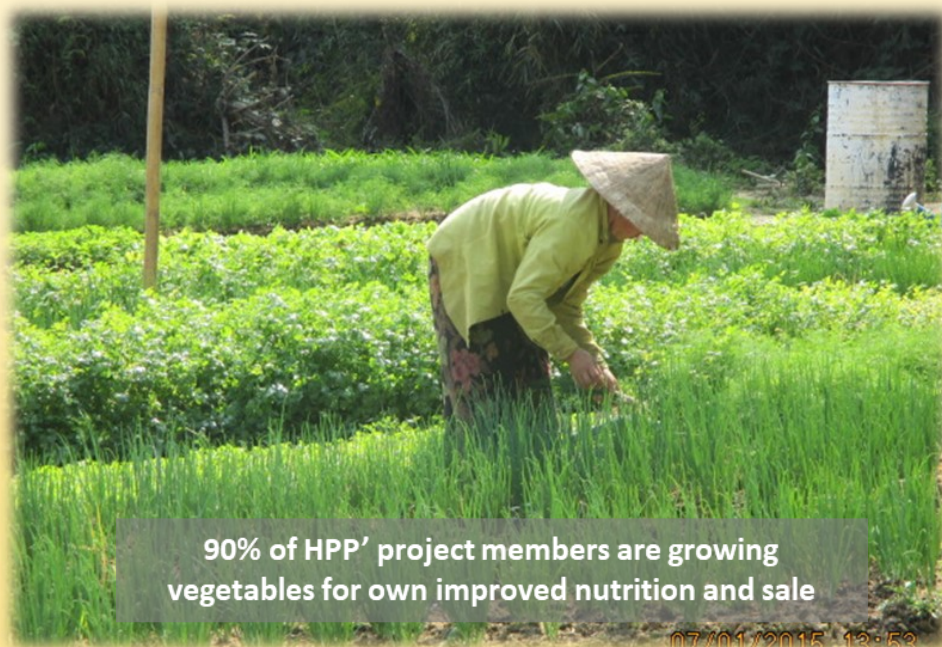
90% of HPP' project members are growing vegetables for own improved nutrition and sale